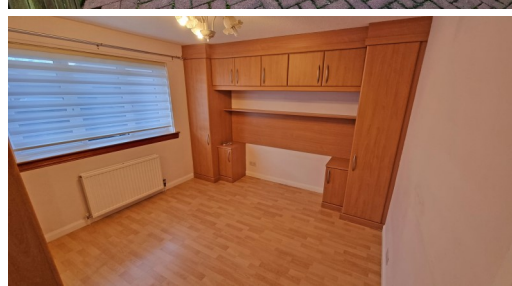
THE PROPERTY MISDESCRIPTIONS ACT 1991